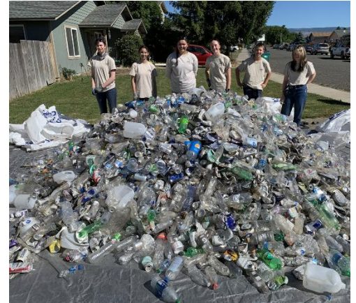
Litter collected by Ellensburg Youth Corp, along the highway ( https://ecology.wa.gov/blog/august-2023 )